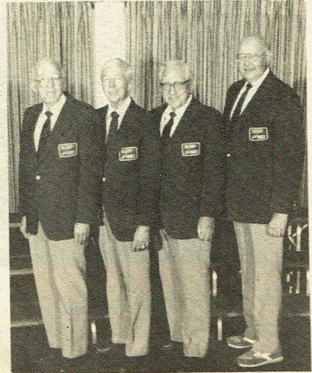
FOUR TUNE HUNTERS

In the production of a Desert-Aires Show the word goes out for quartets and men start to gather to see if one can be organized. If they get it all together its rehearsals and time because basically they're hams. Believe Me, I know exactly how a Ham feels and..what one will do to get on stage..in front of a Mic... That JUST happens to have an audience on the other side. We have THREE QUARTETS on our show this year that will surely make your night a little brighter.