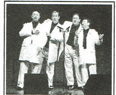
Finale Far Western District Quartet Champions 2001-2002