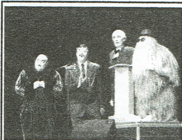
Hi-Fidelity In their Addam's Family Men Routine 2004 Division Champs

Featuring Two Great Quartets from the Far Western District