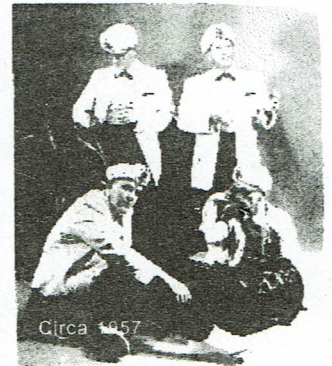
Desert Knights 1957 FWD Champions Back by Popular Demand

Sunday, February 26, 2006, 1:30 pm and 6:00 pm at the Sun Dial in Sun City, Arizona (Located at Boswell and 103rd Avenue)