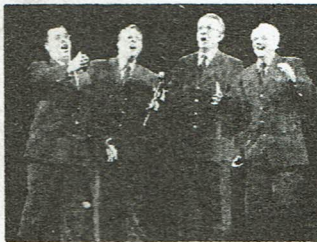
Stardust FWD 2nd Place 2005 And 1st Place Div.5 2004 & 2005

Featuring Two Great Quartets from the Far Western District